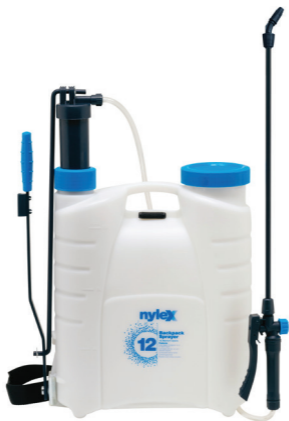
Backpack Sprayer 12L